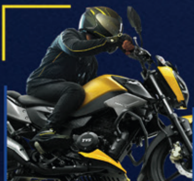
COMFORTABLE RIDING POSTURE