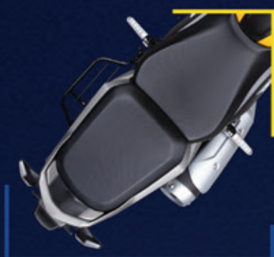
WIDER SPLIT SEAT