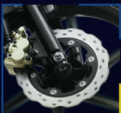
ROTOPETAL DISC BRAKE