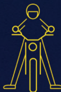
EASY GROUND REACH