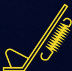
SIDE STAND INDICATION AND ENGINE CUT-OFF