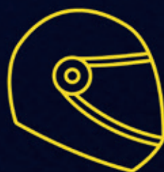
HELMET ATTENTION INDICATION